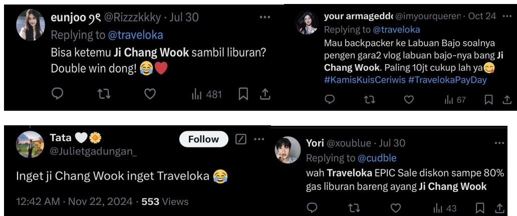
Gambar 2. Netizens' posts on X about Traveloka

It can be observed in the search results on the X application, where many netizens expressed their joy over the selection of Ji Chang Wook as Traveloka's brand ambassador, with some even stating that they wanted to use Traveloka because of Ji Chang Wook. In this context, power functions to influence consumer behavior, in line with the goals of MPR to encourage the audience to behave in accordance with marketing objectives, such as purchasing products or using services. A brand ambassador with power not only attracts attention but also motivates the audience to act, bridging the gap between brand communication and consumer purchasing decisions (Hayati & Damanik, 2022). In the context of tourism, an influential brand ambassador can motivate the audience to choose the destinations or services offered by the brand, increase awareness, and shift their behavior toward the decision to travel using platforms like Traveloka.